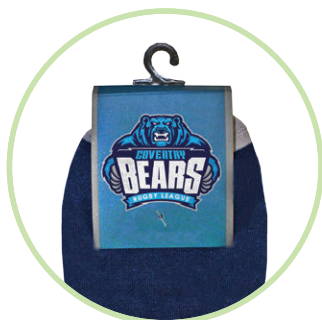
Full Color Hang Tag