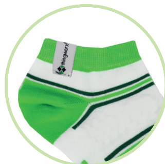
Custom Woven Tags