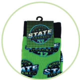
Full Color Hang Tag