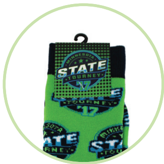
Full Color Hang Tag