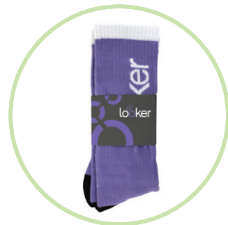
Full Color Wrap Tag