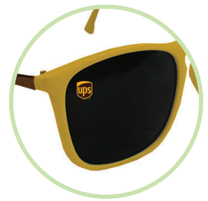
Custom Lens Printing