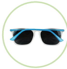
PMS Matched Ear Pieces