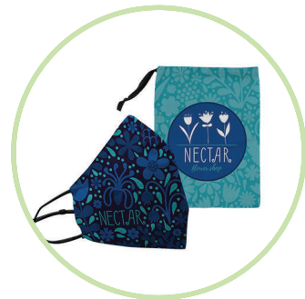
Full Color Pouch