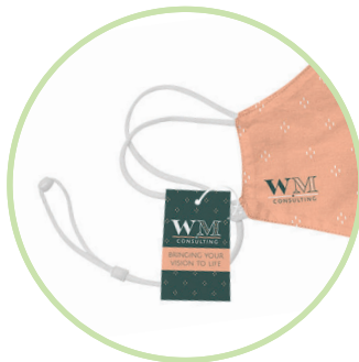
Full Color Hang Tag