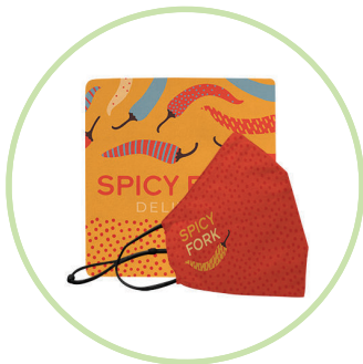
Full Color Insert Card