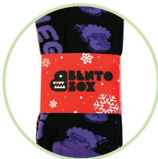
Full Color Wrap