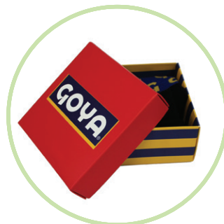
Full Color Sock Box