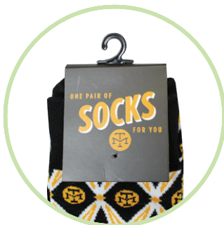
Full Color Hang Tag