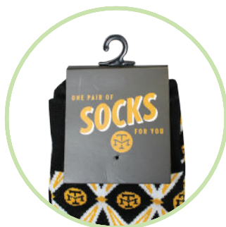
Full Color Hang Tag