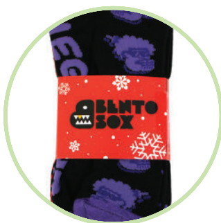
Full Color Wrap