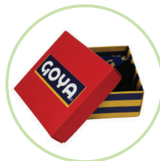
Full Color Sock Box