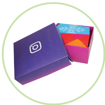
Full Color Sock Box