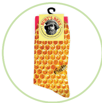
Full Color Hang Tag