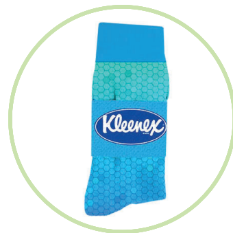
Full Color Wrap Tag