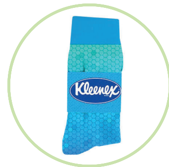
Full Color Wrap Tag