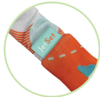
Custom Woven Tag