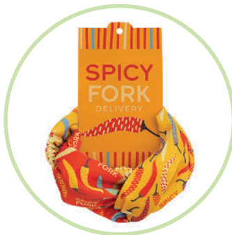
Custom Hang Tag