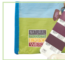
Pantone Spot Color