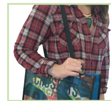
Shoulder Length Handles