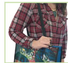
Shoulder Length Handles