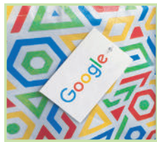
Custom Hang Tag