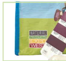
Pantone Spot Color