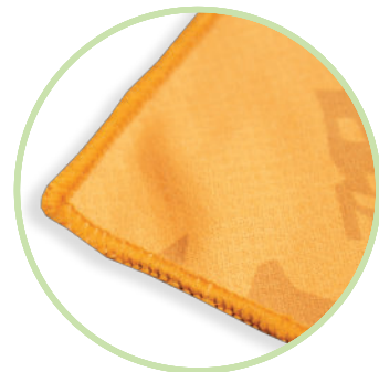
CLOSEST MATCHED STITCHING