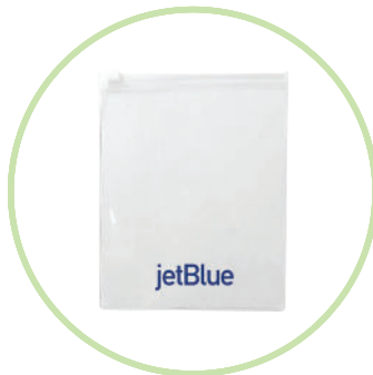
POLAR TOWEL POUCH