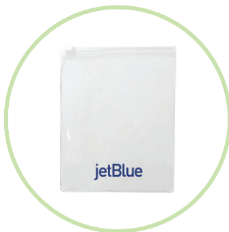
Polar Towel Pouch