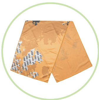
Single Color Print Backside