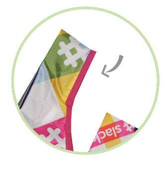
Pantone Matched Piping