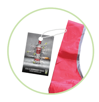
Add a Custom Tag