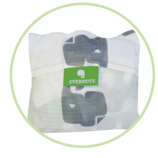
Custom Woven Tag