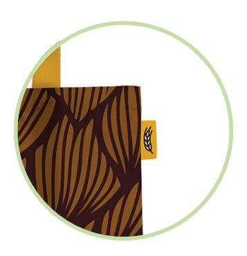
Custom Woven Tag