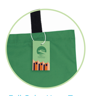
Full Color Hang Tag