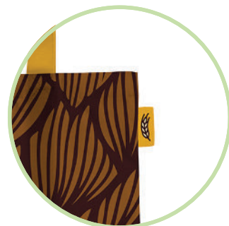
Custom Woven Tag