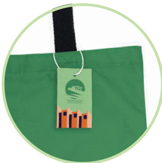
Full Color Hang Tag