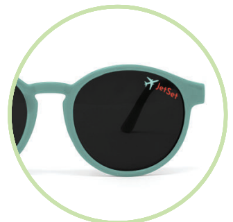
Printed Lens Logo