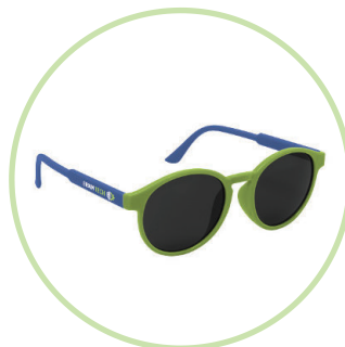
Change Arm Color