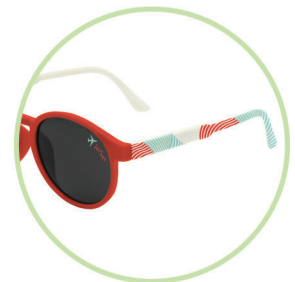
Full-Color Arm Decoration