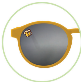
Custom Lens Printing