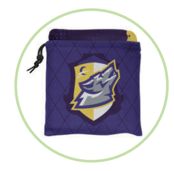
Full Color Fleece Pouch