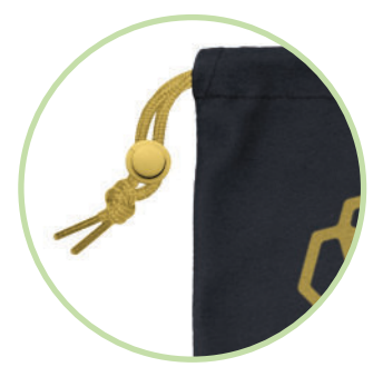
PMS Matched Strings & Toggle