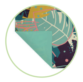
Add Solid Color To Back