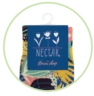
Full Color Hang Tag