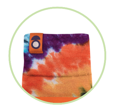
Woven Cuff Tag