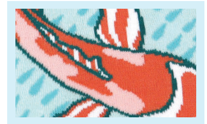
6 Color Knit-in Designs