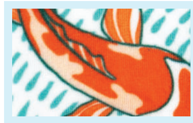
Full Color Digital Printing