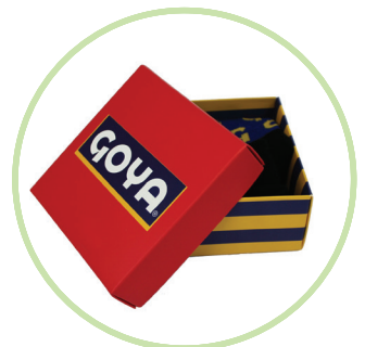
Full Color Sock Box