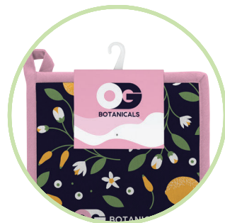
Full Color Hang Tag