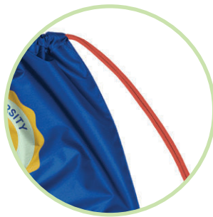
Pantone Matched Strings