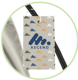
Custom Hang Tag