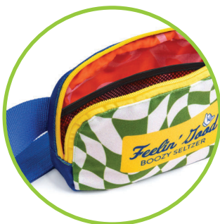
Interior Black Mesh Pocket