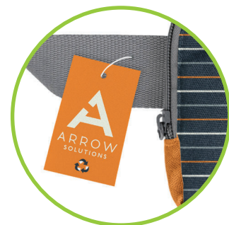
Full-Color Hang Tag

PRODUCTION TIME 15 DAYS (up to 1000 qty)