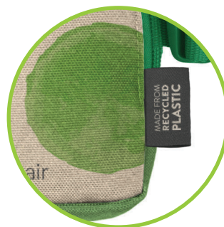
Custom Woven Tag