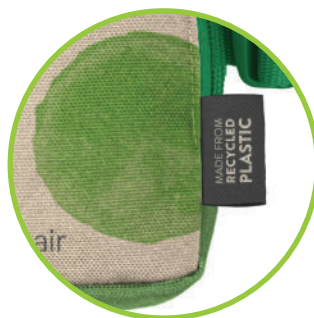
Custom Woven Tag