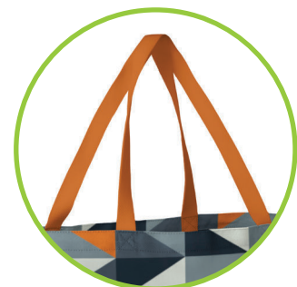
Pantone Matched Handles