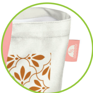
Custom Woven Tag