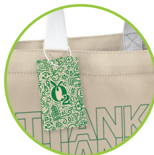
Full-Color Hang Tag