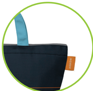
Custom Woven Tag