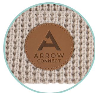
Vegan Leather Patch