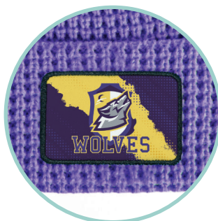
Full Color Patch