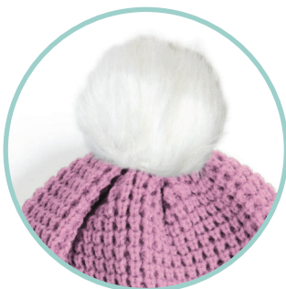
Fur Pom Pom