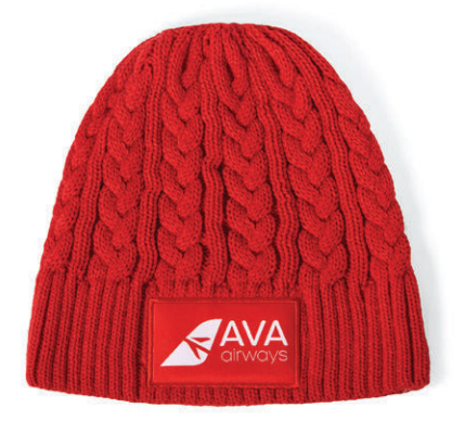
Solid Cable Knit