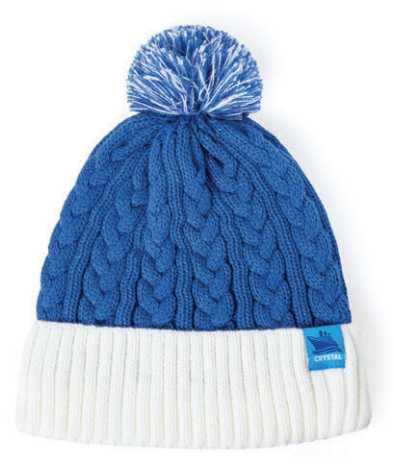
Cable Knit with Contrast Cuff