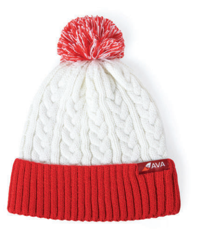
Cable Knit with Contrast Cuff