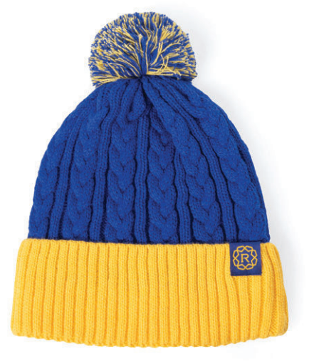
Cable Knit with Contrast Cuff