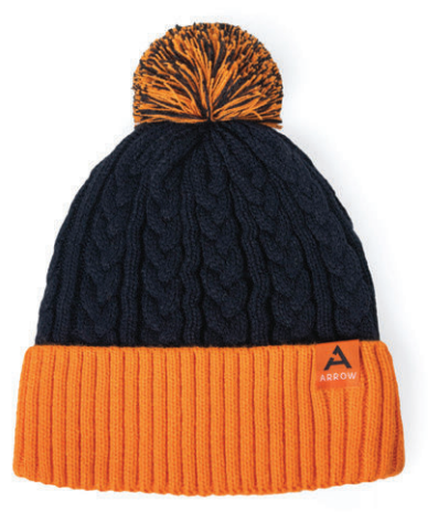
Cable Knit with Contrast Cuff