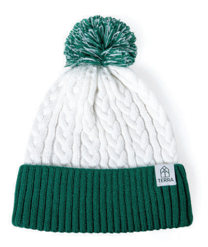
Cable Knit with Contrast Cuff