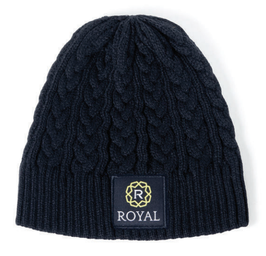
Solid Cable Knit

Creating custom knit beanies just became even simpler! Just pick from one of our 5 popular templated designs, select your colorway, and provide your logo. From there, we knit your custom beanies for you, shipped in as few as 18 working days - with minimums as low as 100!