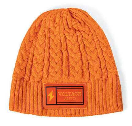
Solid Cable Knit