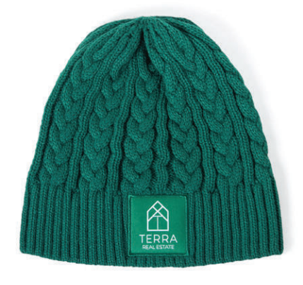
Solid Cable Knit