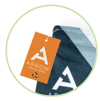
Full-Color Hang Tag