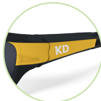
Accent Color on Arms