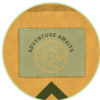
Full-Color Woven Tag