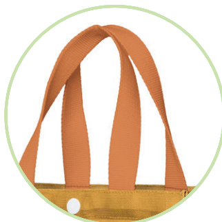
PMS-Matched Webbing Handles