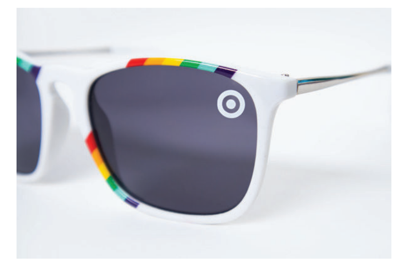
Full-Color Design on Front of Frame