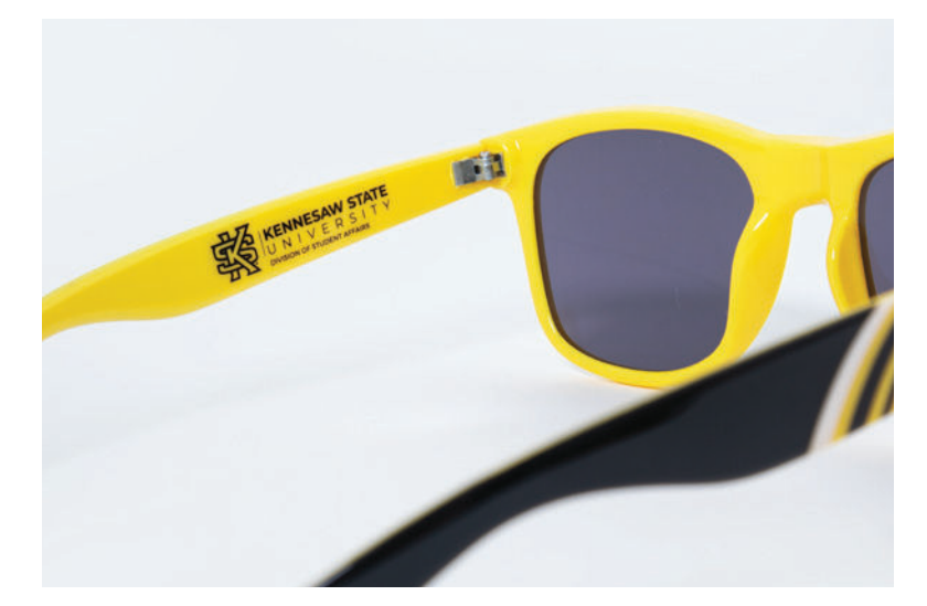
Inside Arm Printing