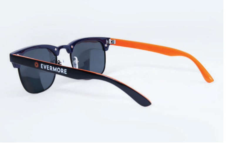
Two-Tone Inside Out