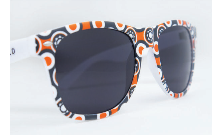
Full-Color Design on Front of Frame