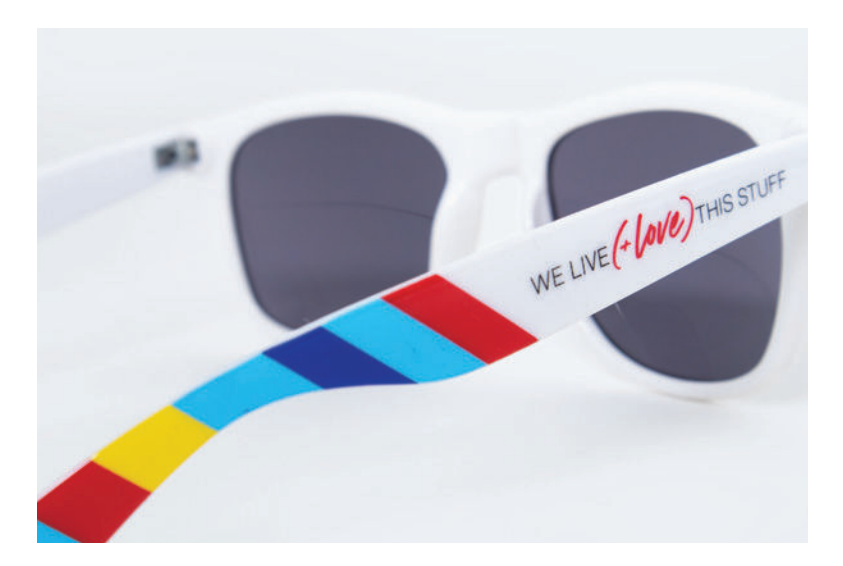
Full-Color Design on Arms