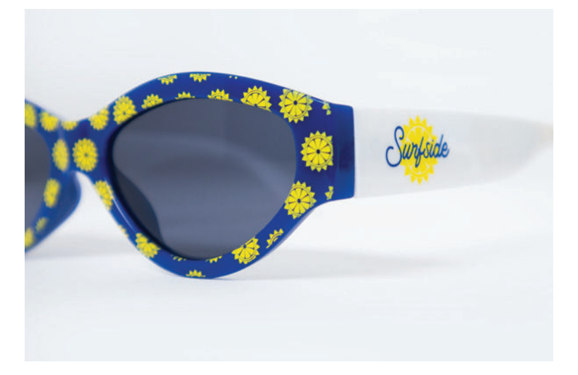
Step & Repeat on Front of Frame