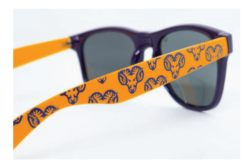
Step & Repeat on Arms

Transform your sunglasses with custom design elements, from intricate screen-printed patterns to stunning full-color artwork. Make every pair uniquely yours, showcasing your brand with every detail.