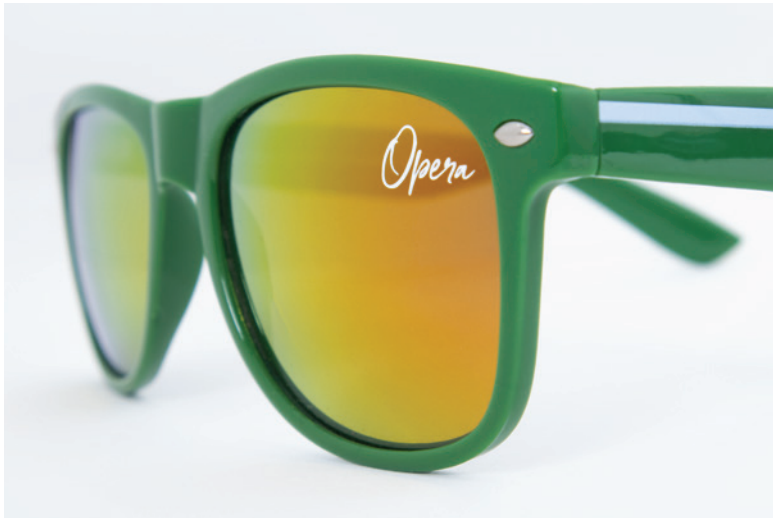
Metallic lenses available in 7 colors