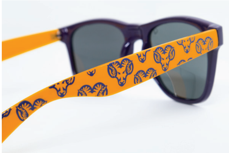
Step & Repeat on Arms

Transform your sunglasses with custom design elements, from intricate screen-printed patterns to stunning full-color artwork. Make every pair uniquely yours, showcasing your brand with every detail.