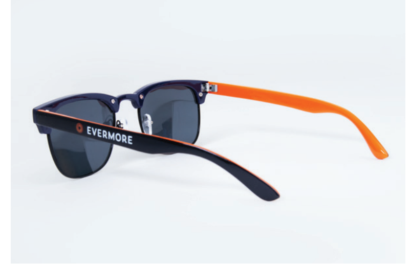
Two-Tone Inside Out