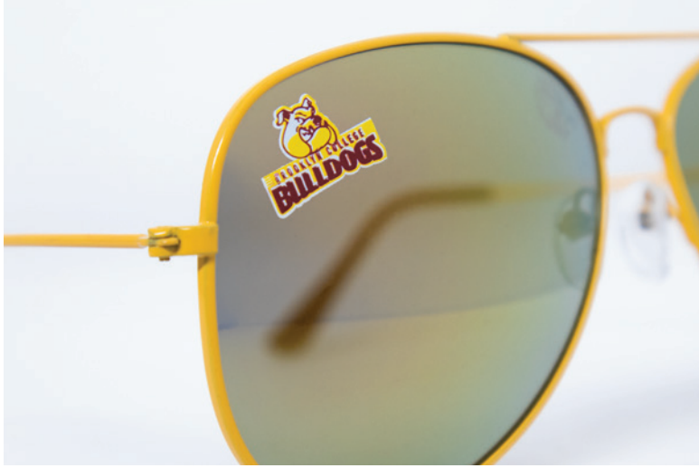
Add a custom lens logo in up to 3 colors

Enhance your look with personalized lens logos and vibrant colored metallic lenses. Make a bold statement with every glance, showcasing luxury and unique style directly on the lenses.