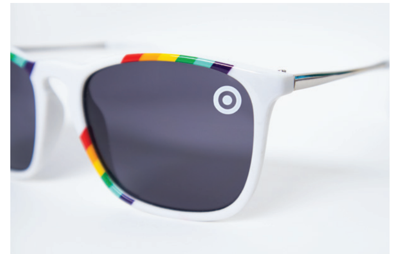
Full-Color Design on Front of Frame