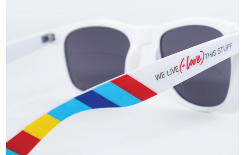
Full-Color Design on Arms