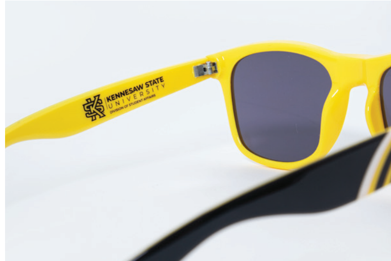
Inside Arm Printing