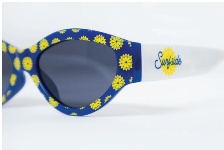
Step & Repeat on Front of Frame