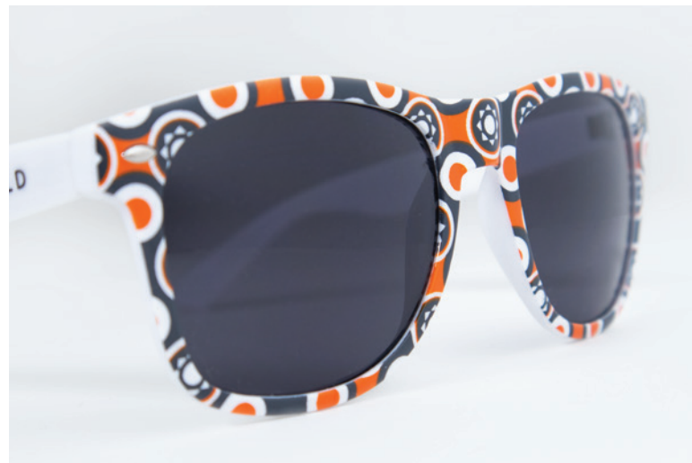
Full-Color Design on Front of Frame